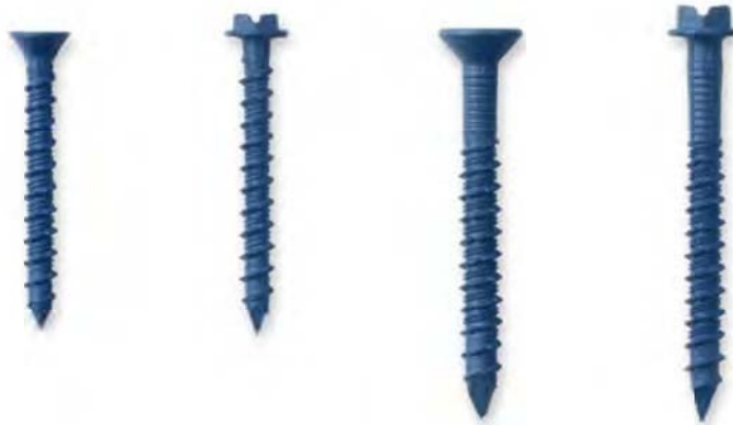
FIGURE 1—TAPCON® SCREW ANCHOR WITH ADVANCED THREADFORM TECHNOLOGY