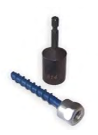
FIGURE 2—LENGTH IDENTIFICATION SYSTEM