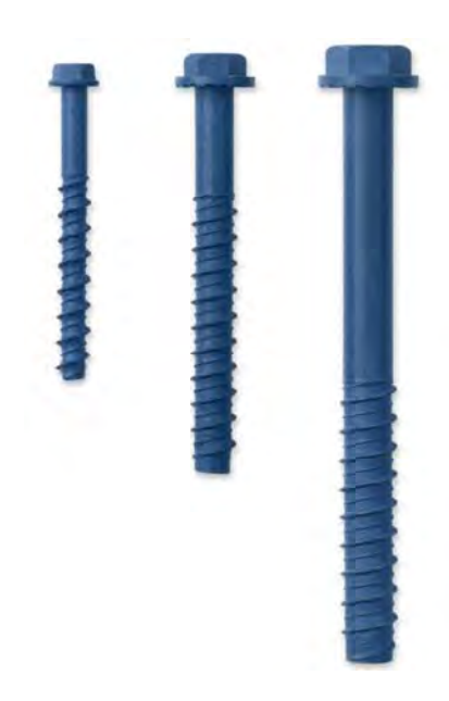
FIGURE 1—TAPCON+ SCREW ANCHOR WITH ADVANCED THREADFORM TECHNOLOGY