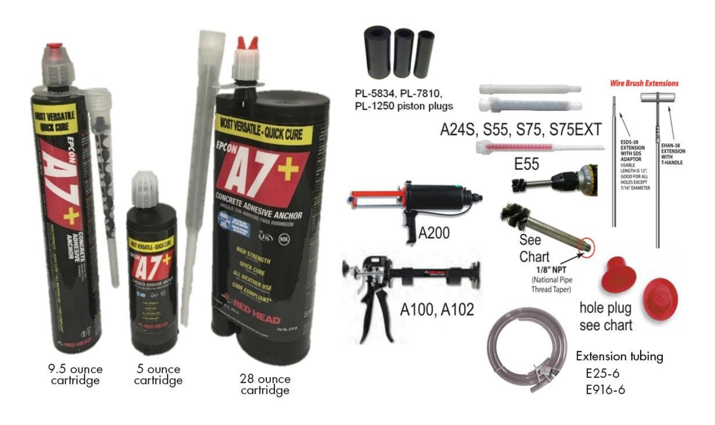
FIGURE 1—RED HEAD EPCON A7+ ADHESIVE CARTRIDGES, DISPENSING TOOLS, MIXING NOZZLES, HOLE CLEANING BRUSHES AND HOLE PLUGS

ITW COMMERCIAL CONSTRUCTION NORTH AMERICA (CCNA) 155 HARLEM AVENUE GLENVIEW, ILLINOIS 60025 (800) 848-5611 www.itwredhead.com Adhesive-Anchors@itwccna.com