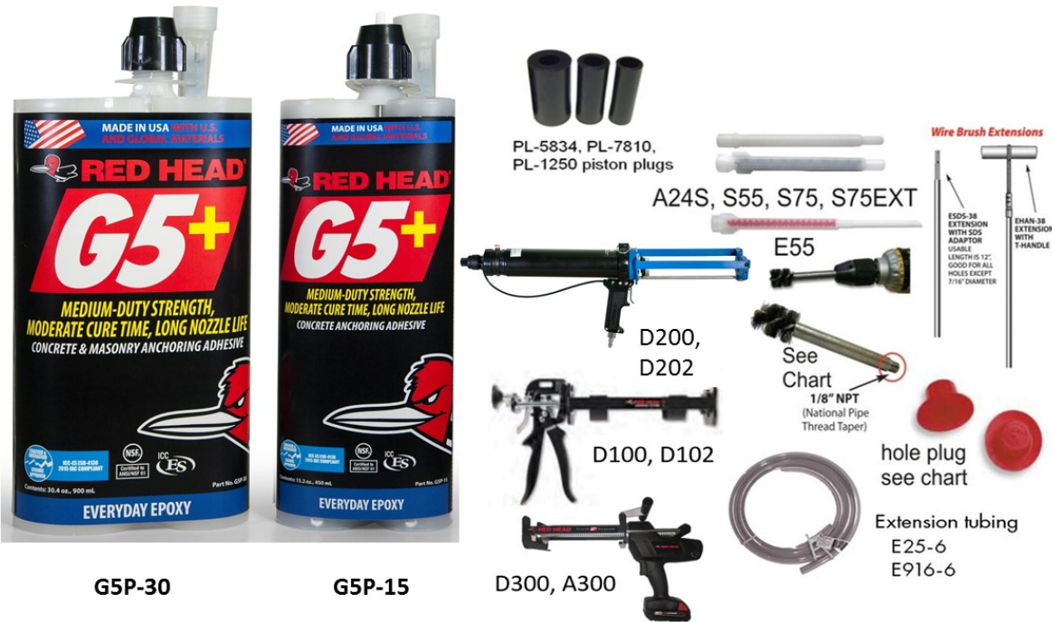
FIGURE 1—RED HEAD G5+ ADHESIVE CARTRIDGES, DISPENSING TOOLS, MIXING NOZZLES, HOLE CLEANING BRUSHES AND HOLE PLUGS