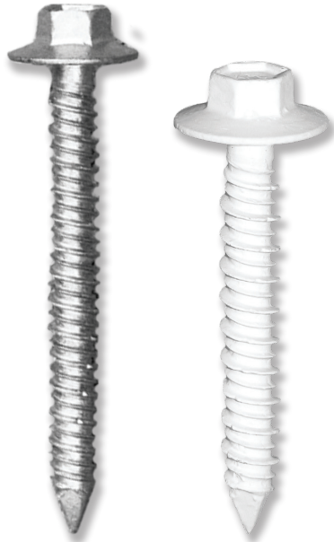
UltraShield White UltraShield