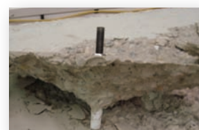
Concrete Failure Test

The RED HEAD in-house lab conducts a wide range of tests and services including cyclic, sheer, vibration and seismic, among others, to facilitate the product testing and the approval process.