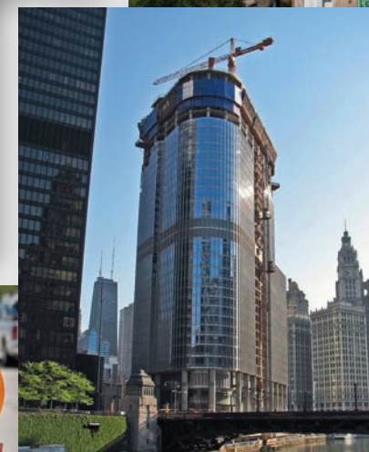
High Rise Construction