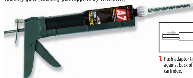
1. Push adaptor tightly

Allows cartridge to work with most standard caulking guns (caulking gun supplied by contractor)