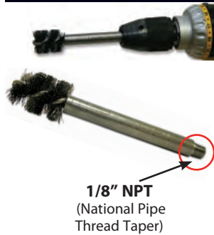
1/8" NPT (National Pipe Thread Taper)

Proper hole cleaning using a brush is essential to achieve optimum performance