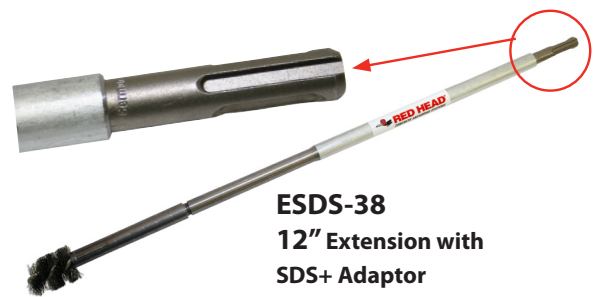
ESDS-38 12" Extension with SDS+ Adaptor (Brush not included)