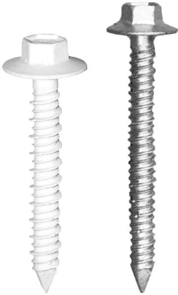
White UltraShield UltraShield